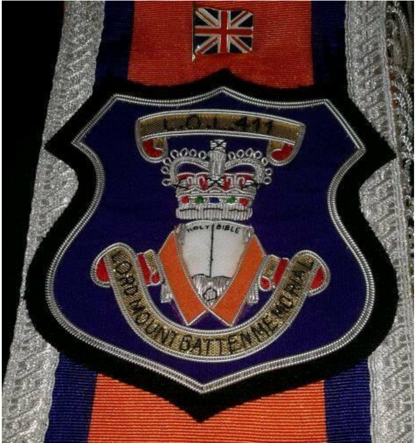
Lord Louis Mountbatten Memorial LOL