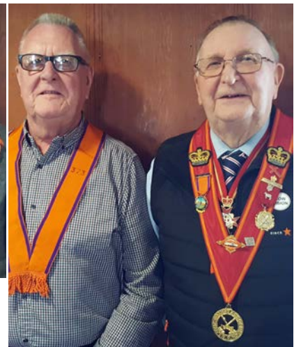
Above right R - L