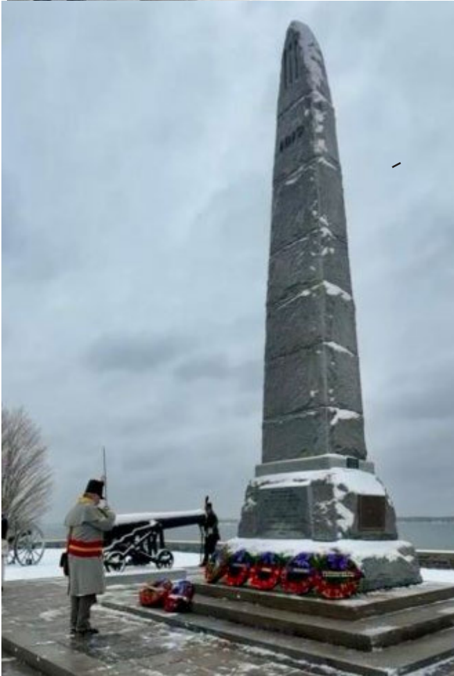
The Canadian Fencibles observe Remembrance at Chryslers Farm Monument near Morrisburg Ont