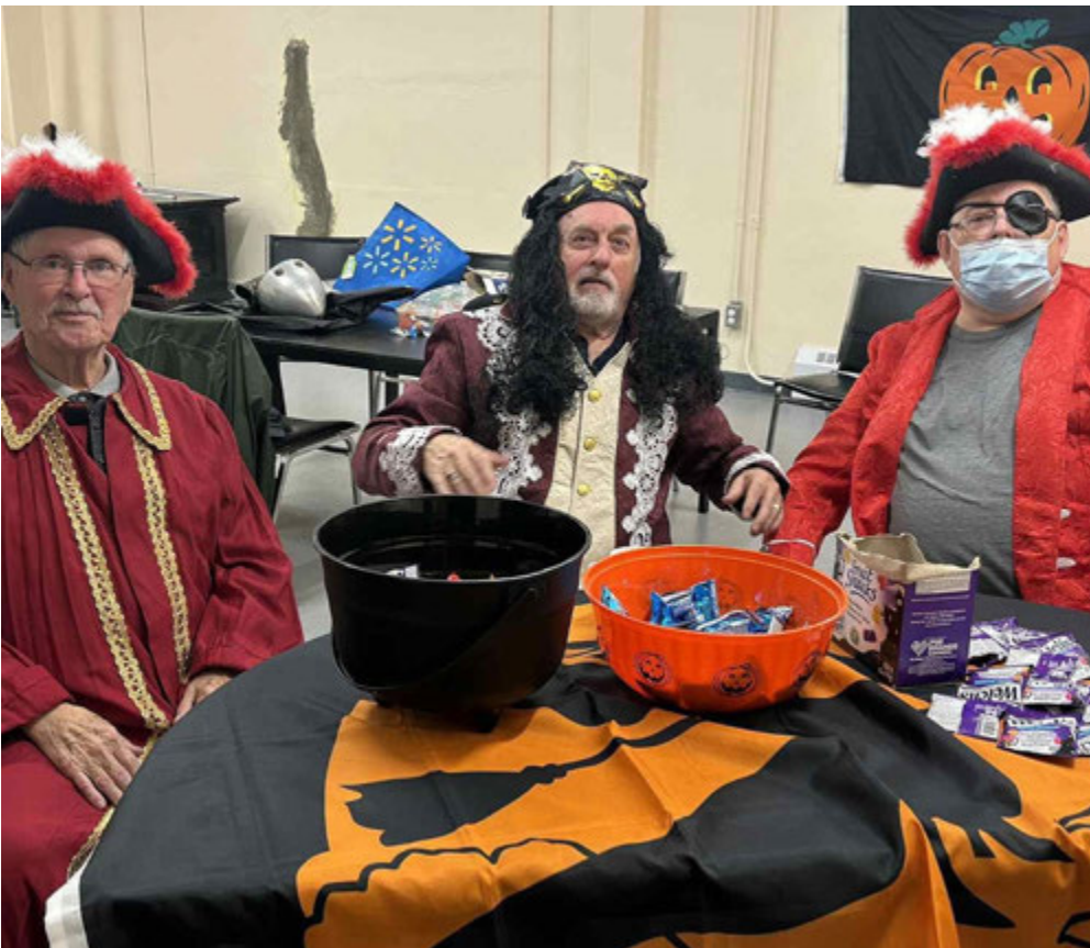
On Saturday October 25th, Royal Oak Lodge participated in Good Samaritan Anglican Church's Pumpkin Carving Event. At the conclusion of the carving, the kids visited various areas throughout the Church where they received treats. Their final stop was at the Lodge Room of Royal Oak Lodge where they encountered three swabs who greeted them well with their enjoyment.